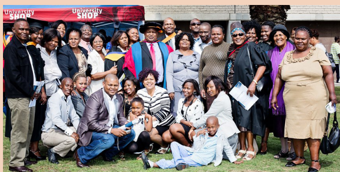
This is a very happy family