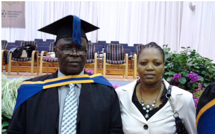
KZN high school principal, and his wife.