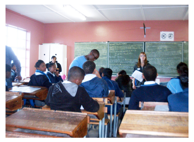
George - Parkdene Secondary School

The faculty also had a beautiful stall at the George Open Day exhibition where all our programmes were promoted. The stall attracted alot of attention confirming the interest in Education as a career option. The students who worked at the stall created a positive hype around the stall and enthusiastically informed interested parties about our programmes.