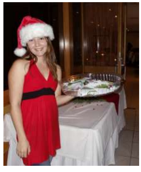
Our very own Santa Elf hands out gifts!