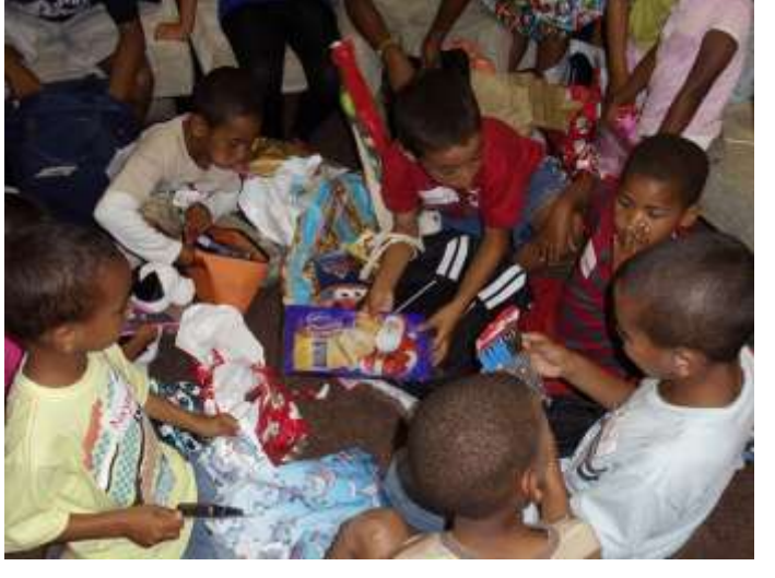
Wow! What have you got there?