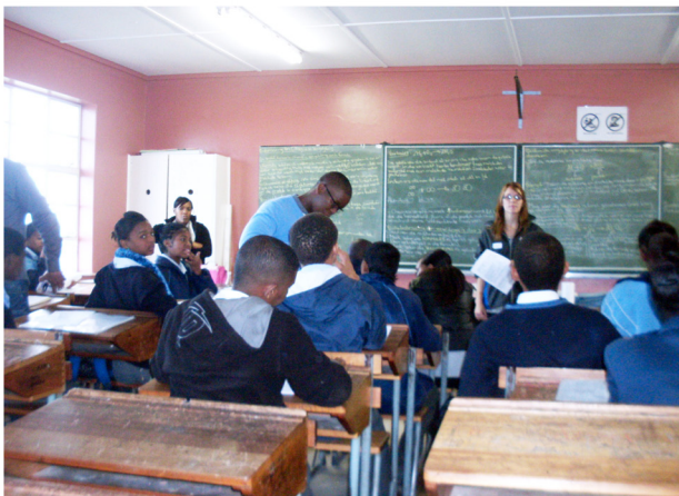
George - Parkdene Secondary School