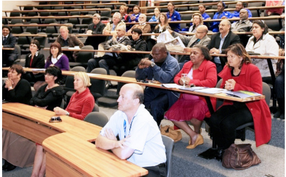
Delegates representing a cross-section of stakeholders, including the education sector, local government and organised business attended NMMU's Education Sector breakfast event during the university's annual Open Day in George.

Hoërskool Outeniqua was also acknowledged for contributing significant numbers of students for Port Elizabeth-based programmes of NMMU.