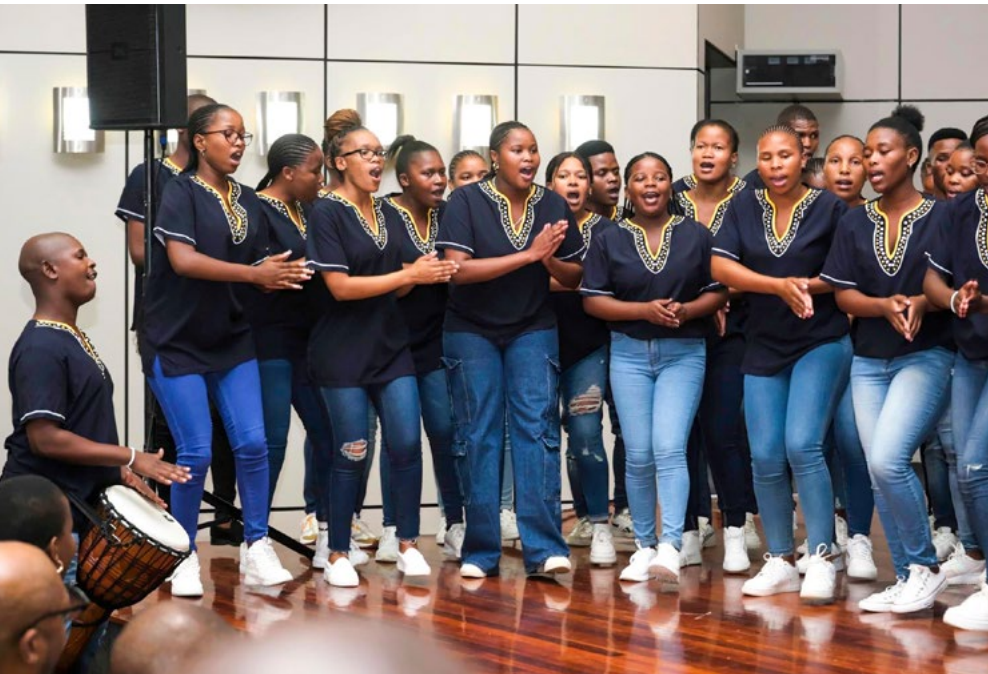
Future Teachers Choir performing at the recent Robert Sobukwe Memorial Lecture

Our choir has applied to be a recognised student society body in the Creative Arts Portfolio which will enable them to formalise their activities and include a wider membership of students.