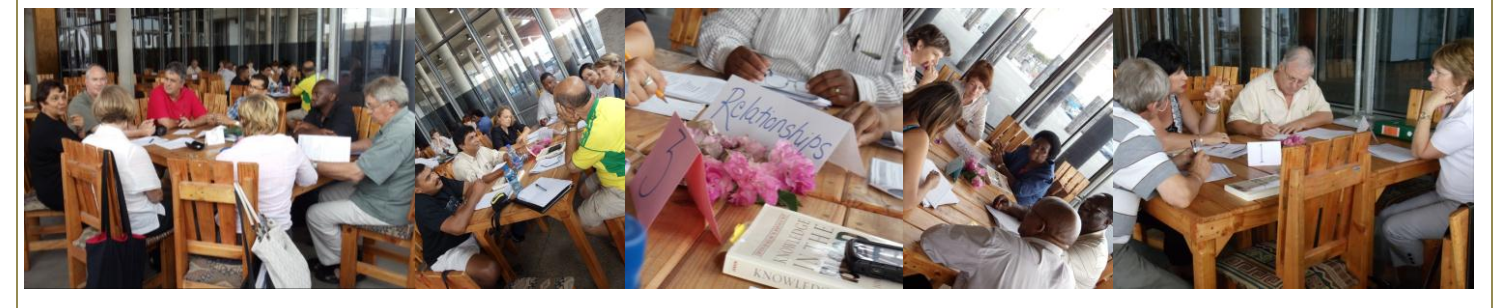
... five tables, five topics, 20 minutes for each conversation ...