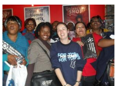
No conference can be a success if you don't go shopping at the University Shop!