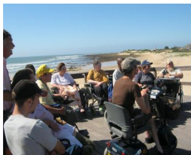
Residents and volunteers soak up some sun at the PE beach front