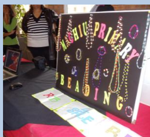
Bead work products made by learners at Machiu Primary School as part of their project

The topics chosen by the school teams covered an interesting range of issues: improving safety at school (Malabar and Kama); addressing teenage pregnancy (Gelvandale); trying to instil a culture of reading (St James); reducing late-coming (Woolhope); improving parental involvement (Dower); extending participation in extra mural activities (Sapphire); providing skills development for children with barriers to learning (Machiu); and improving the moral climate of the school (Charles Duna).