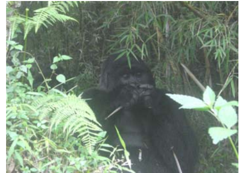
A silver back (adult male) mountain gorilla