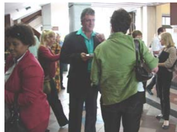
Enjoying lunch and a celebratory glass of wine after the presentations