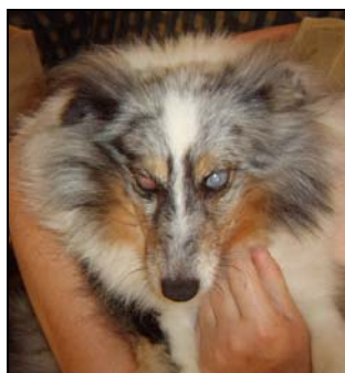
The 'Old Girls'