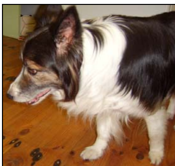
Dulce (16) & Foxie (11)