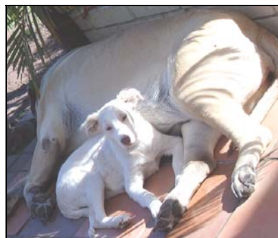
The biggest (English Mastiff, Ruby) & smallest (Border Collie, Sapphire)