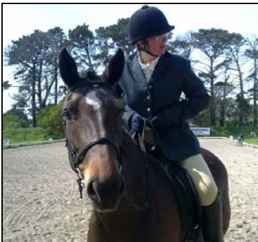
Silent Wings & Me at PE Riding Club

I live on a smallholding in Little Chelsea with my 7 dogs, 4 horses and a brat of a donkey (see evidence below). What keeps me busy... reading, teaching, riding my horses and showing my dogs. What do I have planned for the future? Most definitely not a PhD, I am aaaaaall studied out!