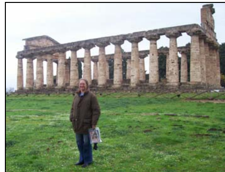
Pesteum, Italy 2007 – finally!