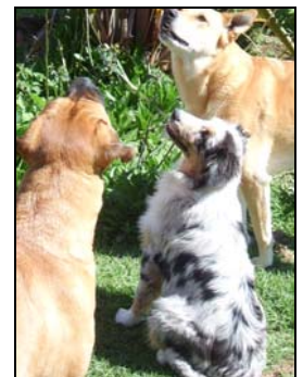
Crystal, Luna & Topaz