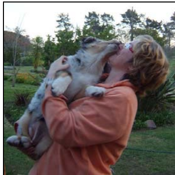
Luna, the Australian Shephard