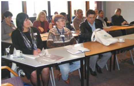
Colleagues at the inter-faculty workshop