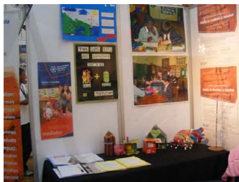
The Faculty of Education open day stand