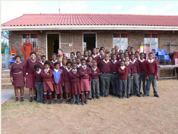
Happy-smiley faces in Grades 4 – 9