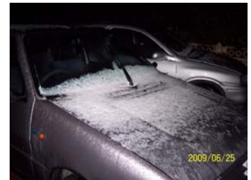
snow in PE!

Funds raised will assist the Trust to run their Crèche and to purchase materials to make pottery, which they sell and in so doing become self sustainable. ~ Vernon & Flip